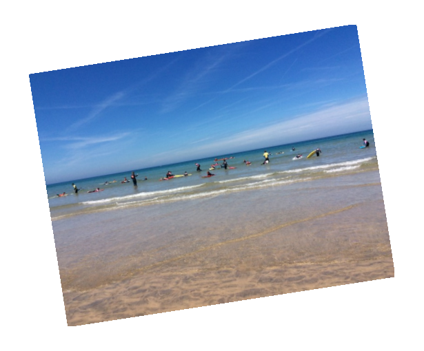
Friday 5th July Years 4,5 and 6 learning Beach Safety and how to surf.